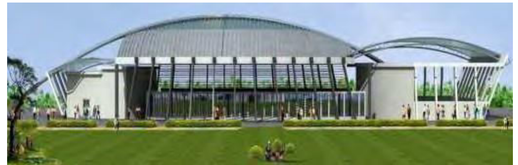
ICE SKATING RINK & INDOOR STADIUM | Dehradun , Uttarakhand