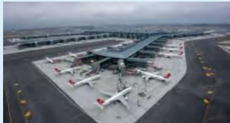
Jewar International Airport

There is no denying the fact that NOIDA is 'the investment hotspot' for the real estate sector in North India