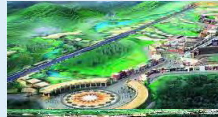
Proposed Film City