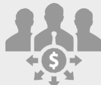
Attraction for investors