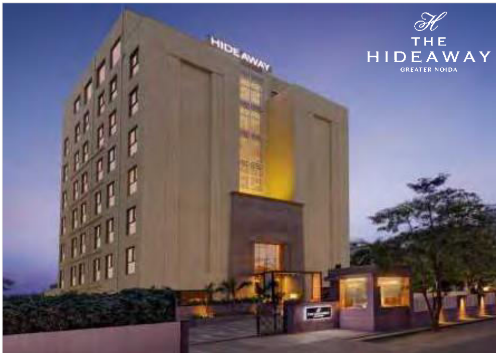
HOTEL | Knowledge Park 1, Greater Noida