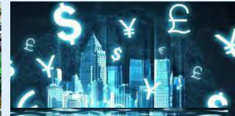
50 investment proposals worth Rs 7,000 crore from international investors

Existing upcoming projects are just a small indicator of Noida's growth potential.