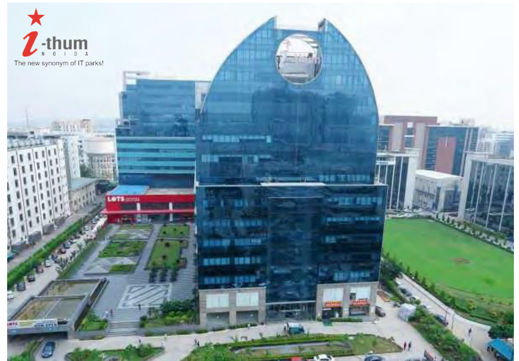
IT PARK | Sector 62, Noida