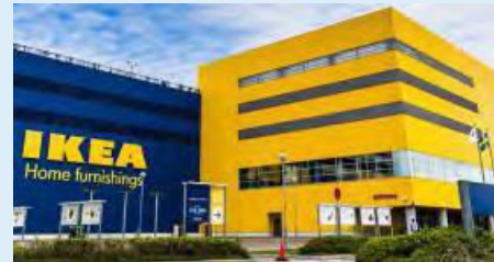
IKEA is all set to begin work of its biggest store in Noida