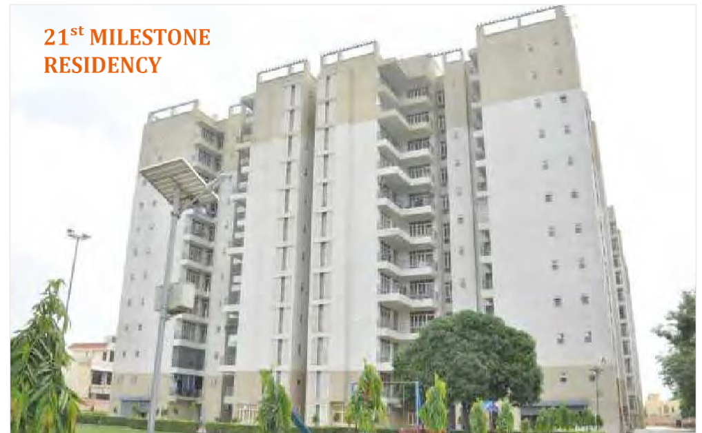
Rajnagar Ghaziabad | 2 & 3 BHK Apartments