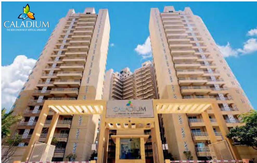
Sector 109, Gurugram | 3 & 4 BHK Apartments & Penthouses