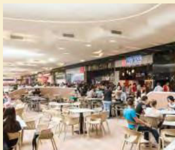
Assorted food hall

While the retail center is sure to attract a vibrant mix of high street retail, experiential stores, and luxury brands, Tastefully designed Gourmet Galleria is conceived to deliver a tantalizing experience for the entire spectrum of visitors ranging from regular eatery seekers to enthusiastic foodies and experience seekers.