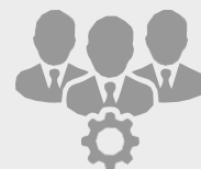
The establishment of companies